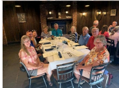
Having group dinner with all cruisers in the historic Robert Morris Inn.