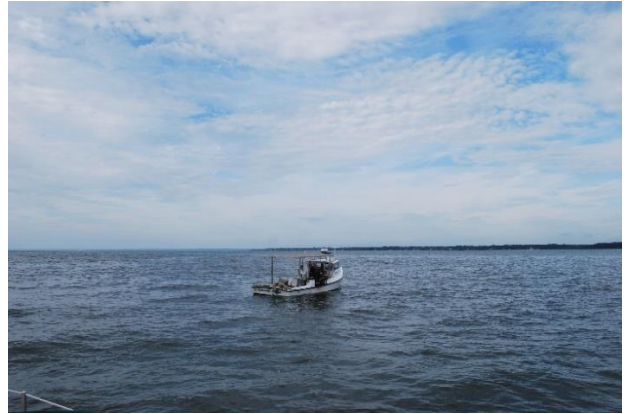
Fishermen working the Bay