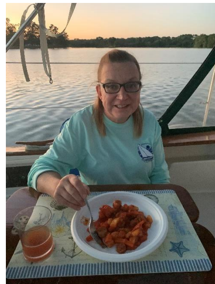
Dinner is served