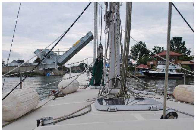
Going through Knapps Narrows – Thank you 4ft draft on SV Island Time