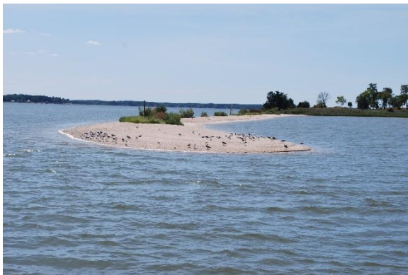
What a lovely place La Trappe Creek was