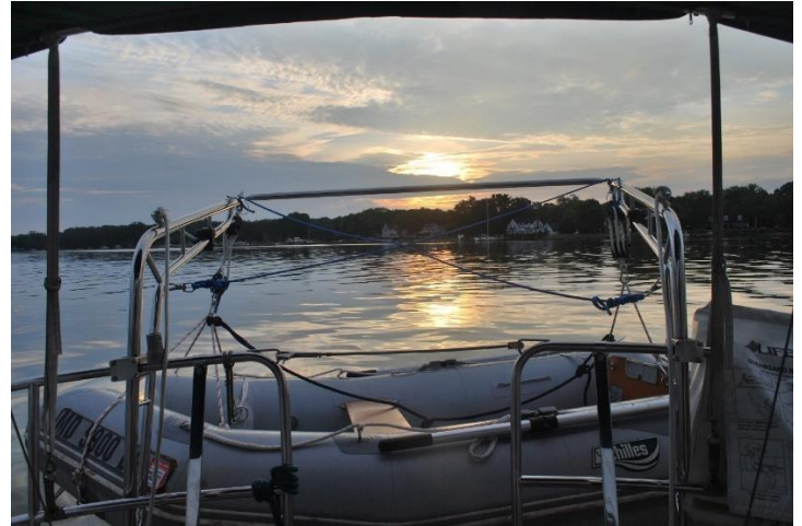
Sunset at West River/Galesville