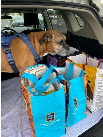
Almost had a cast away

Saturday August 31 – Day 1 – We left our home around 11 AM and got underway from our slip at Belvedere Yacht Club (BYC) at 1:15PM. The wind was mostly from the south, as we traveled south toward West River (as usual, wind was on the nose, again) Last year we installed a Lazy Jack system on our main sail, which enables us to raise and lower the main sail even for a short duration and we motor sailed with the main sail up out of the Magothy River, turning south toward our destination. We arrived at West River around 6PM, the MRSA flotilla of 5 boats were already enjoying the happy hour. We dropped anchor in front of the Pirates Cove and settled in for the night.