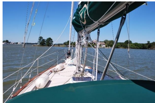
Due to our shallow draft, we had our own "private cove" to drop the hook