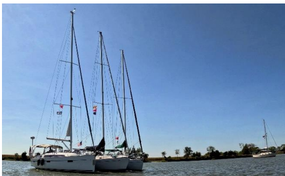
Flotilla Happy Hour rafting up