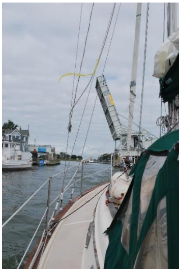
Heading back home, going through Knapps Narrow west bound