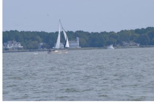
It was a glorious windy day on Choptank River

Distance traveled – 13nm plus couple hours' worth of joy riding